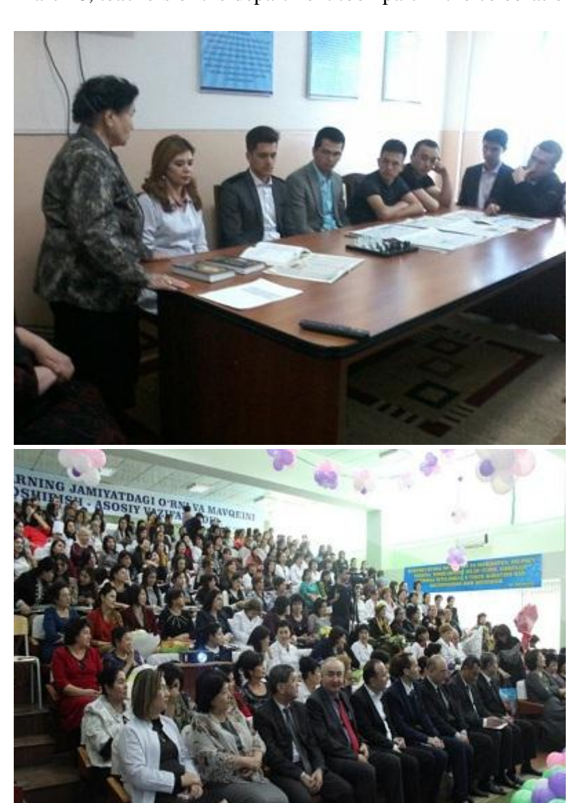
March 8, teachers of the department took part in the celebration of International Women's Day.